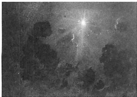
STAR OF BETHLEHEM.

Then, in tender mercy, Spirit sped this loyal ray, to rouse the living, wake the dead and point the Way.