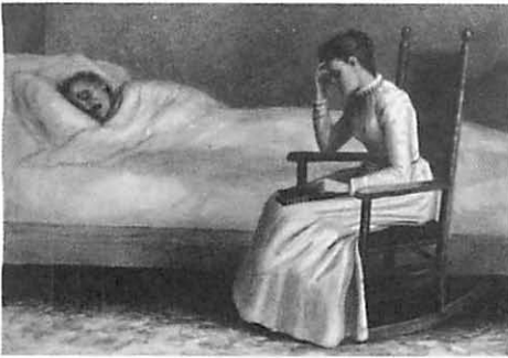
TREATING THE SICK.

Our Leader was fulfilling her mission to point the Way. Even more, she was, and is the Way.