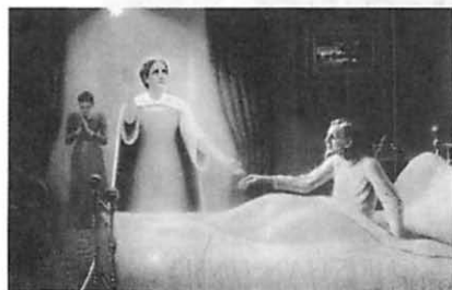
CHRISTIAN SCIENCE HEALING

But this new view of Christ as a living Vine to be demonstrated was largely rejected. Mary's experience was not unlike that of Jesus when he healed the ten lepers. One of them returned to express thanks. Mary, too, found that nine-tenths of those whom she healed and taught were indifferent or apathetic. They clung to their former beliefs tenaciously and sought to continue the worldly pleasures, especially concerning their limited concept of Christ.